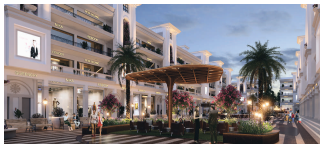
SERENE LANDSCAPE & STREETSCAPE