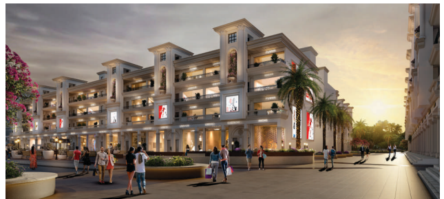
SMOOTH PEDESTRIAN MOVEMENT