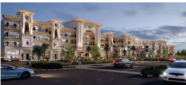
SMOOTH VEHICULAR MOVEMENT